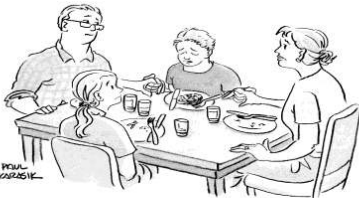
"Mom, Dad, sis—I'm not like you. I'm—I'm not a palindrome."