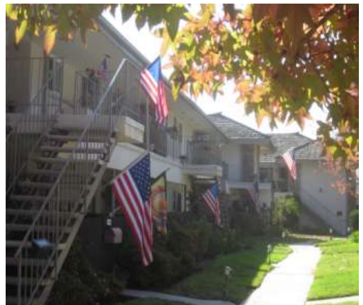
Patriots Alley, 11/11/2013