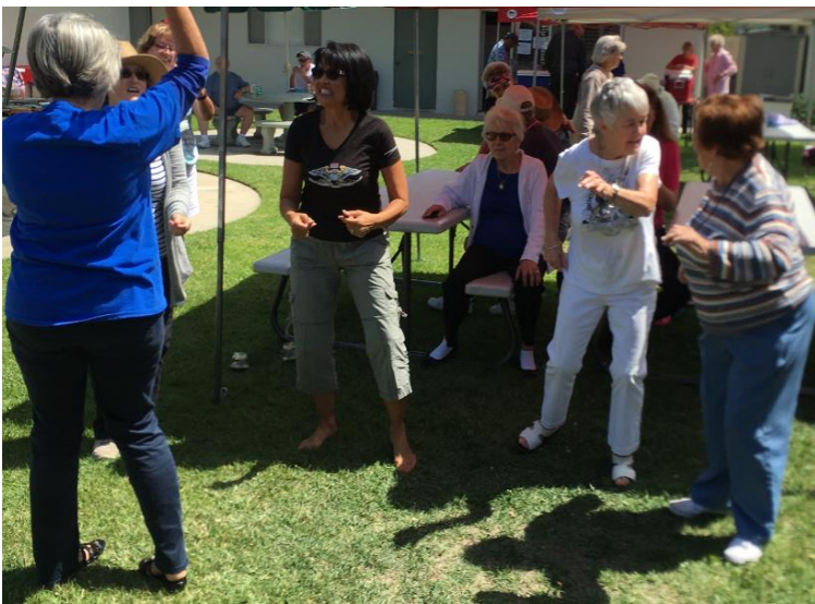
SOME LABOR DAY DANCERS