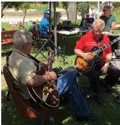
THESE ARE OUR GREAT ENTERTAINERS