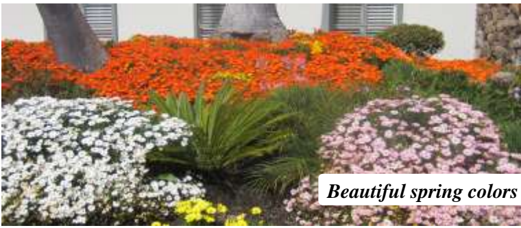
Beautiful spring colors at our Clubhouse