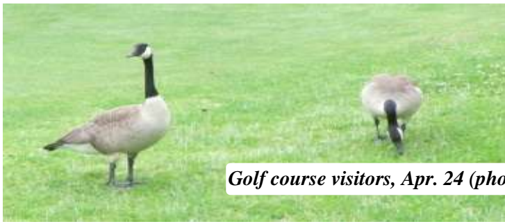
Golf course visitors, Apr. 24